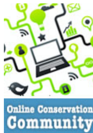
Online Conservation Community